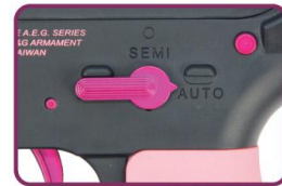
Full Auto Automatic firing