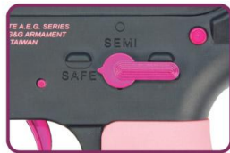
Safety On The trigger cannot be pulled