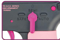
Semi Auto Single shot