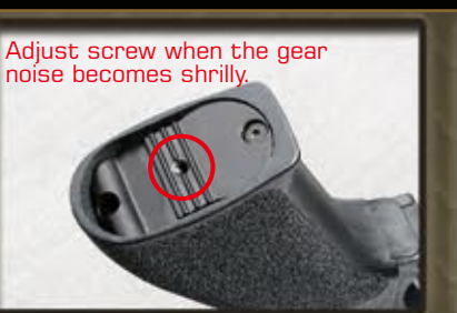
The screw at bottom of the grip. Please use the screwdriver to adjust.